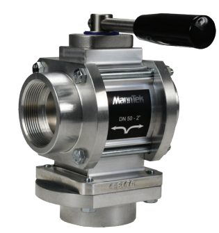
one way, grooved